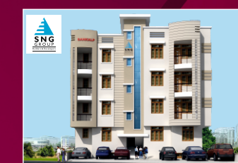
Sankalp Vidhyadhar Nagar, Jaipur