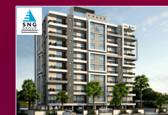
Floreat Niwaru Road, Jaipur