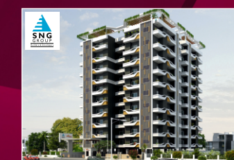
Shree Ratna C-4, Banipark, Jaipur