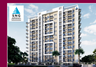
Sphere A-11,12 Near Chomu Puliya, Sikar Road, Jaipur