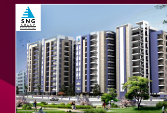
Shree Enclave Niwaru Road, Jaipur