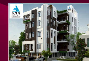
Shreedham Ambabari, Sikar Road, Jaipur