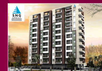
Majestic Heights Kalwada, Near Mahindra Sez, Jaipur