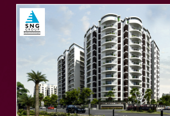
Ozone Sirsi Road, Near Vaishali Nagar, Jaipur