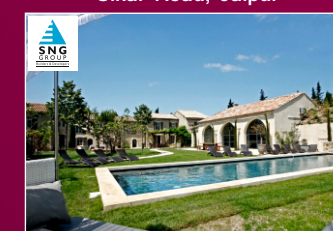
Prakrati Farm House Jaipur