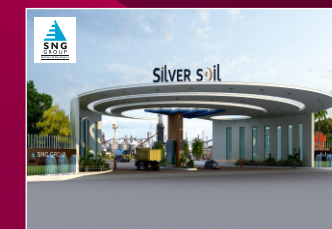
Silver Soil Industrial Park NH-11 Main Sikar Road, Jaipur