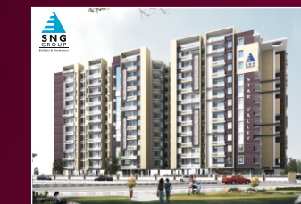
Star Valley Murlipura, Jaipur