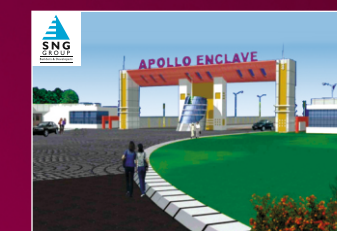
Apollo Enclave Ajmer Road, Jaipur