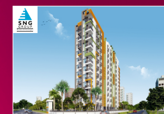
Krishnangan Banipark, Jaipur