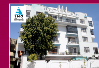
Samriddhi Enclave Bapu Nagar, Jaipur