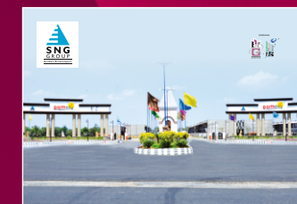
Parth City Kalwar Road, Jaipur