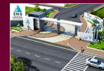
Parth City Churu