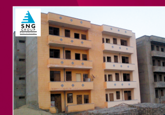
Affordable Housing Kalwada, Churu, Sardarshahar, Bhated-vatika, Sindoli, Bhambori