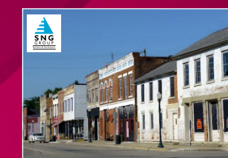
SNG Market Kanota