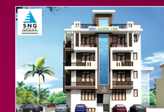
Garden View Vishveshwarya Nagar, Jaipur