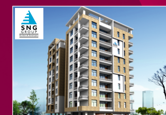
Shivangan A-26, Shastri Nagar, Jaipur