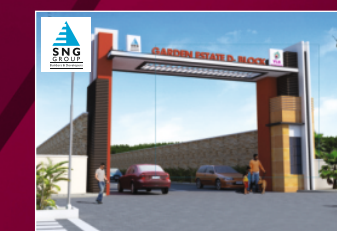
Garden Estate Near Mahindra Sez, Ajmer Road, Jaipur