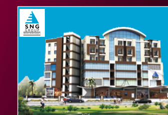
Majestic Tower Kalwada, Near Mahindra Sez, Jaipur